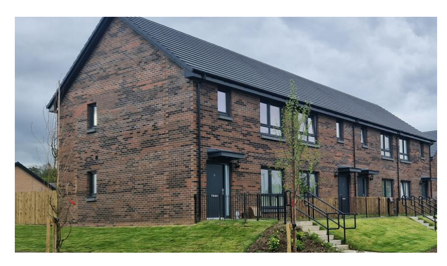
New build Council housing, Ferguslie Park, Paisley

When the Council is assessing development projects included within this Strategic Housing Investment Plan, it will consider these proposals against the policies in the National Planning Framework 4 and the Renfrewshire Local Development Plan 2021.