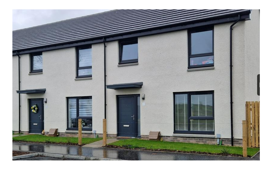
Loretto new build development, Dargavel Village, Bishopton

Renfrewshire's population like Scotland's is ageing with people living longer. In 2021, almost one fifth (19.6%) of Renfrewshire's population was 65 years of age or older (National Records of Scotland).