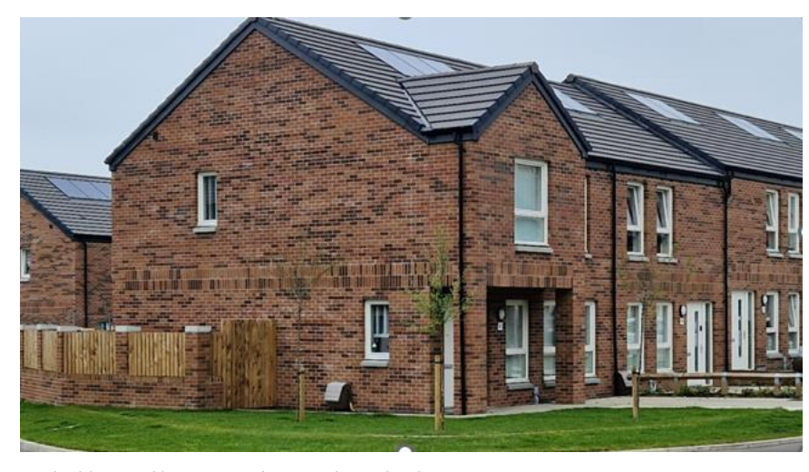
New build Council housing, Auchengreoch Road, Johnstone

Appendix 3 of this Strategic Housing Investment Plan includes any eligible increase in the level of grant funding for each project.