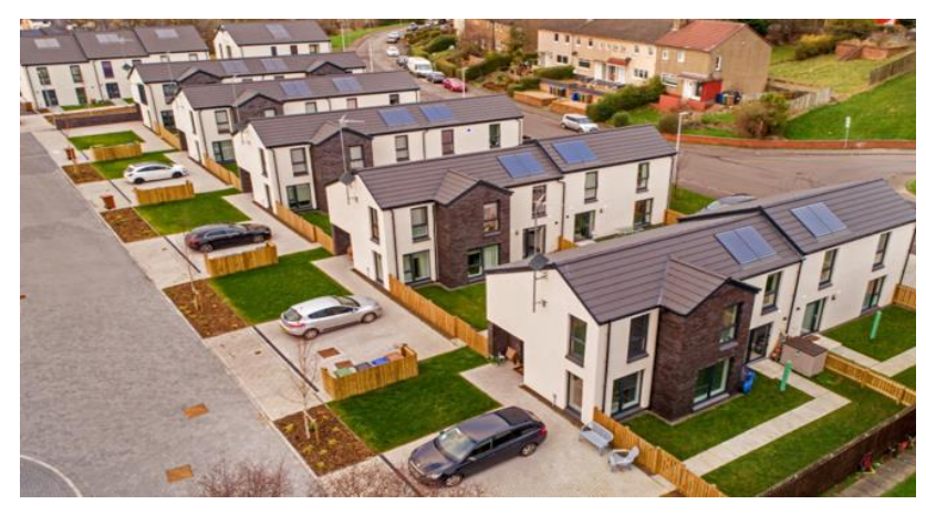
New build social rented housing, St Ninian's Crescent, Paisley (Link Group)

Six weekly internal officer group meetings to review progress.