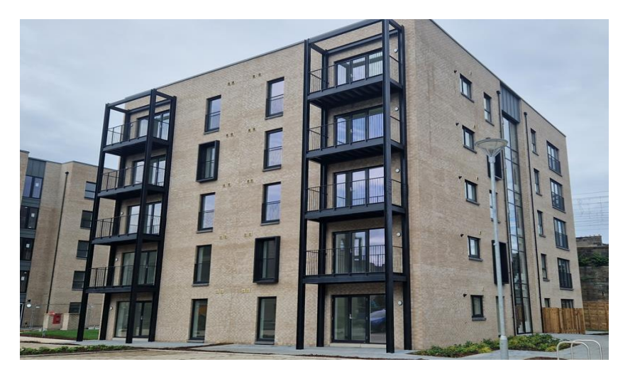
Abbey Quarter Phase 4, Paisley, Link Group