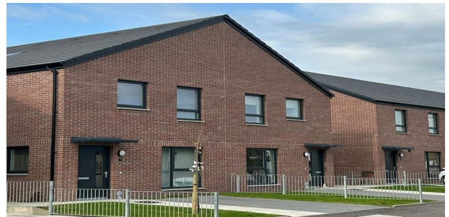
New build social rented housing, Albert Road, Renfrew (Williamsburgh Housing Association)

Economy and Development Team, Chief Executives Service, Renfrewshire Council, Renfrewshire House, Cotton Street, Paisley, PA1 1WB