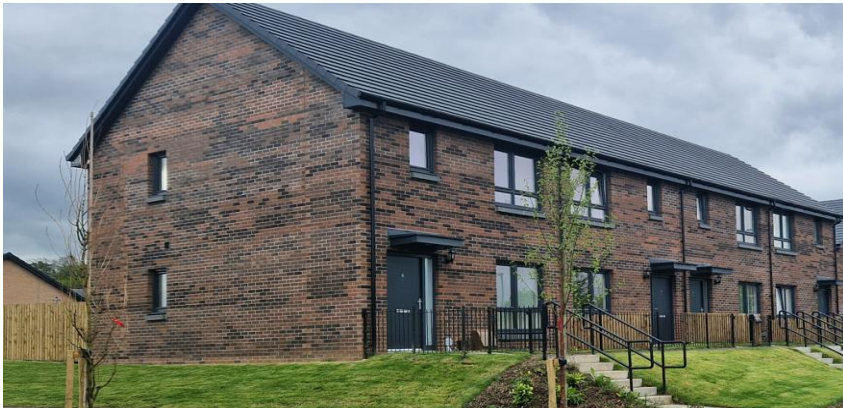
New build Council housing, Ferguslie Park, Paisley

The Council are also progressing new build plans at both Gallowhill and at Garthland Lane in Paisley, with the Council's regeneration programme including additional new Council homes in the Howwood Road area of Johnstone, Thrushcraigs area of Paisley, Broomlands area of Paisley, Springbank area of Paisley and Foxbar area of Paisley.