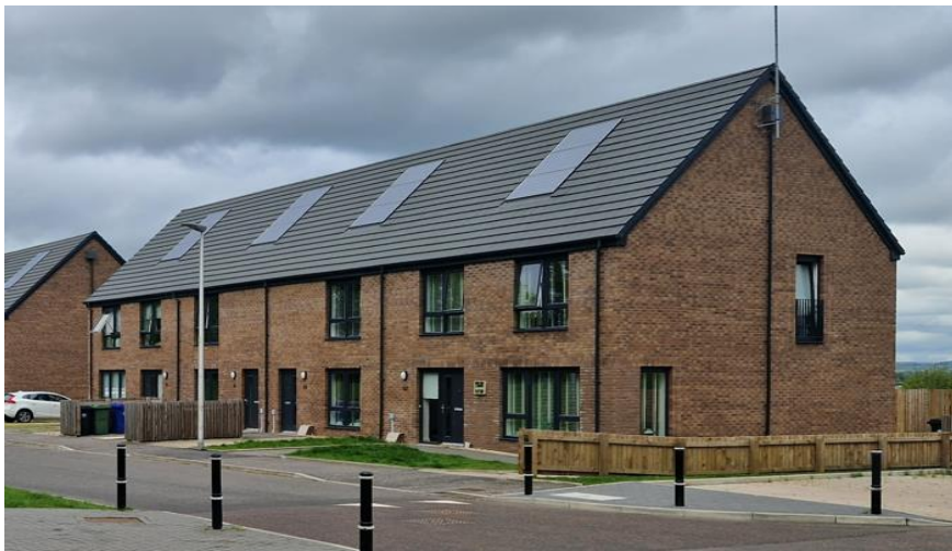
New build social rented housing, Millarston, Paisley, (Link Group)

In recent years, the Council's Empty Homes Officer (now called More Homes Officer) successfully helped to bring 63 long term empty homes back into the effective housing supply ( 2018/19: 14 homes, 2019/20: 26 homes and 2020/21: 23 homes ).