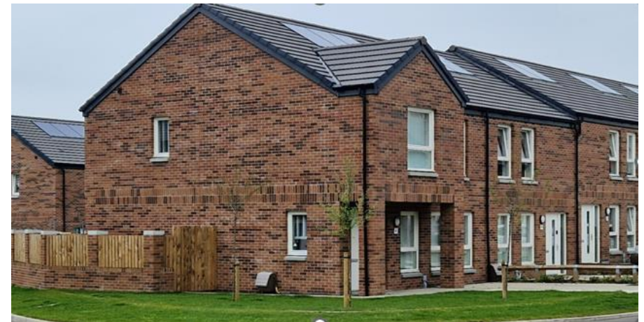
New build Council housing, Auchengreoch Road, Johnstone

The flexible benchmark rates of grant as well as any additional grant being made available to affordable housing developers who incorporate enhanced design elements, is being met from current known Resource Planning Assumptions. This may have an impact on the number of new affordable homes being delivered as the level of grant for each property increases.