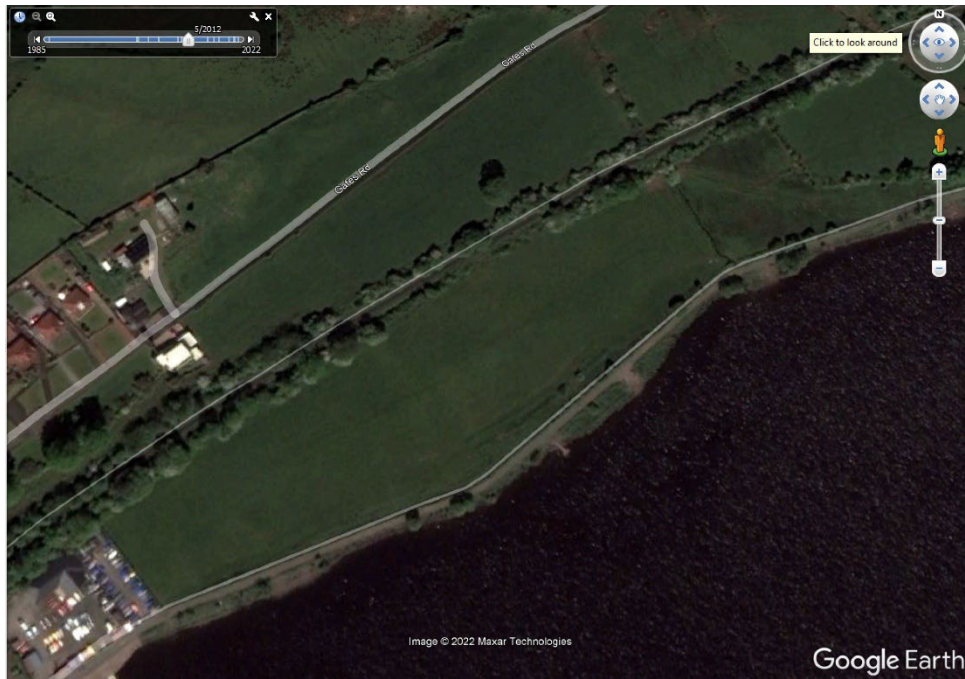
Figure 1) The Lochside field 05/2012