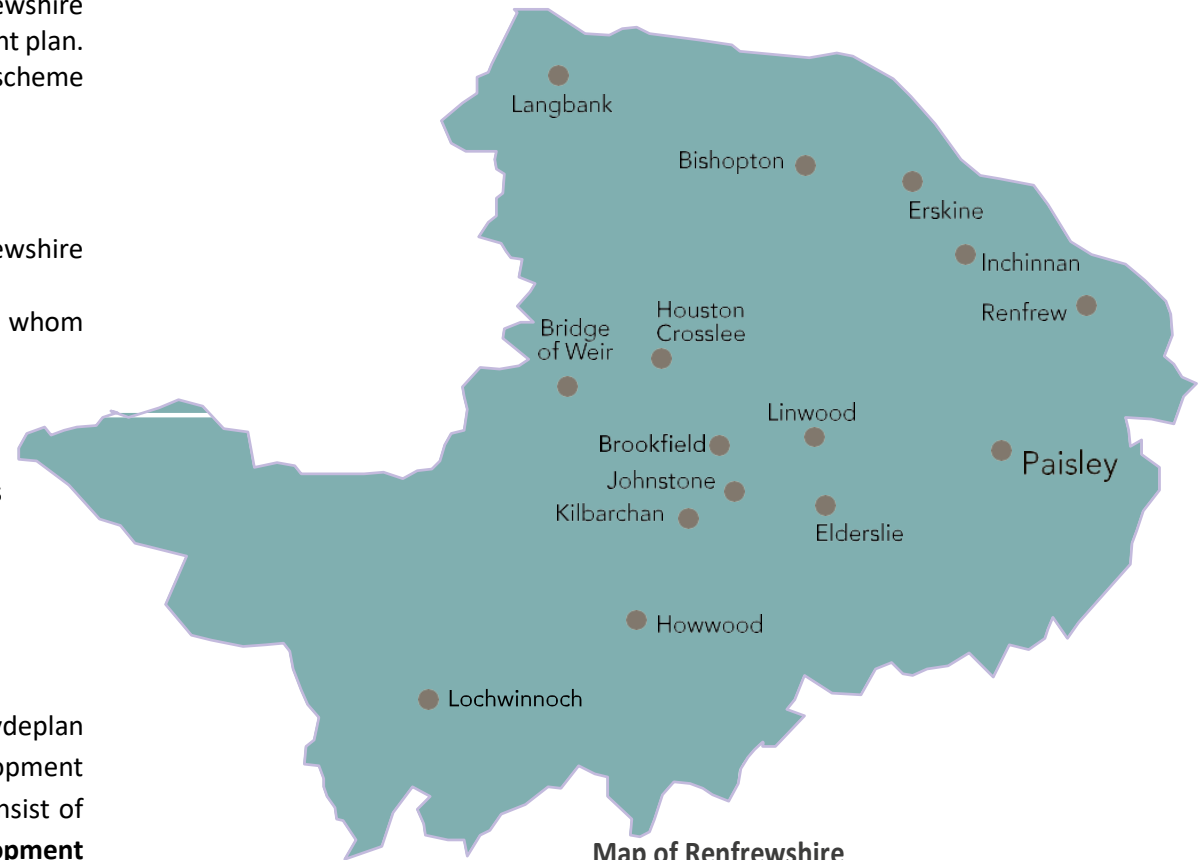
Map of Renfrewshire

Following the publication of the National Planning Framework 4, Clydeplan Strategic Development Plan will no longer form part of the development Plan. At this point the development plan for Renfrewshire will consist of National Planning Framework 4 and Renfrewshire Local Development Plan 2021 .