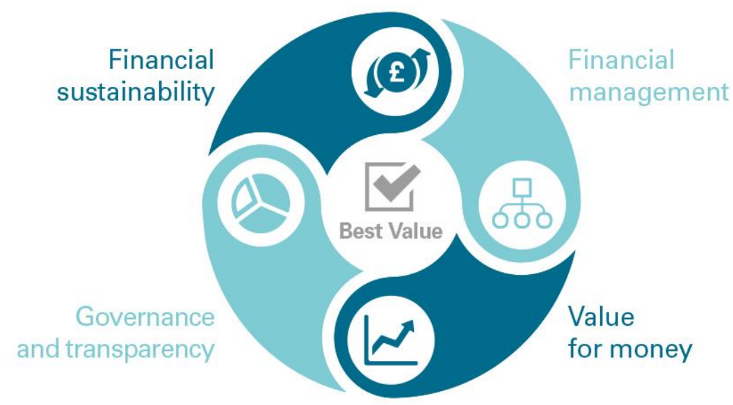
Exhibit 1 Audit dimensions