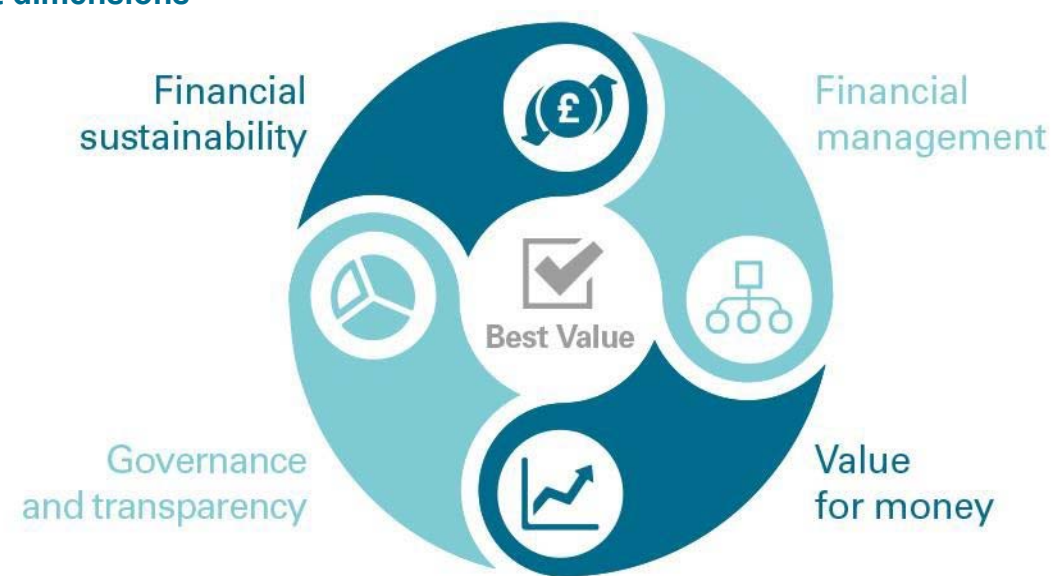
Exhibit 1 Audit dimensions