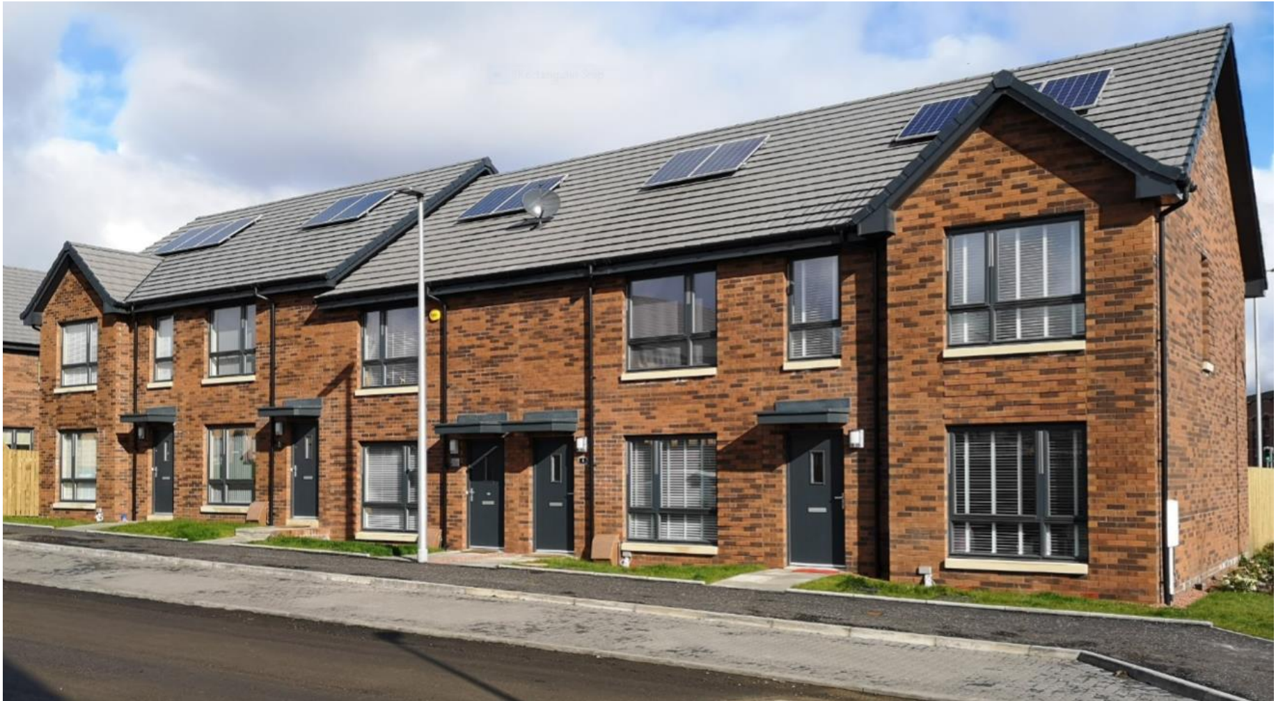
Love Street, Paisley