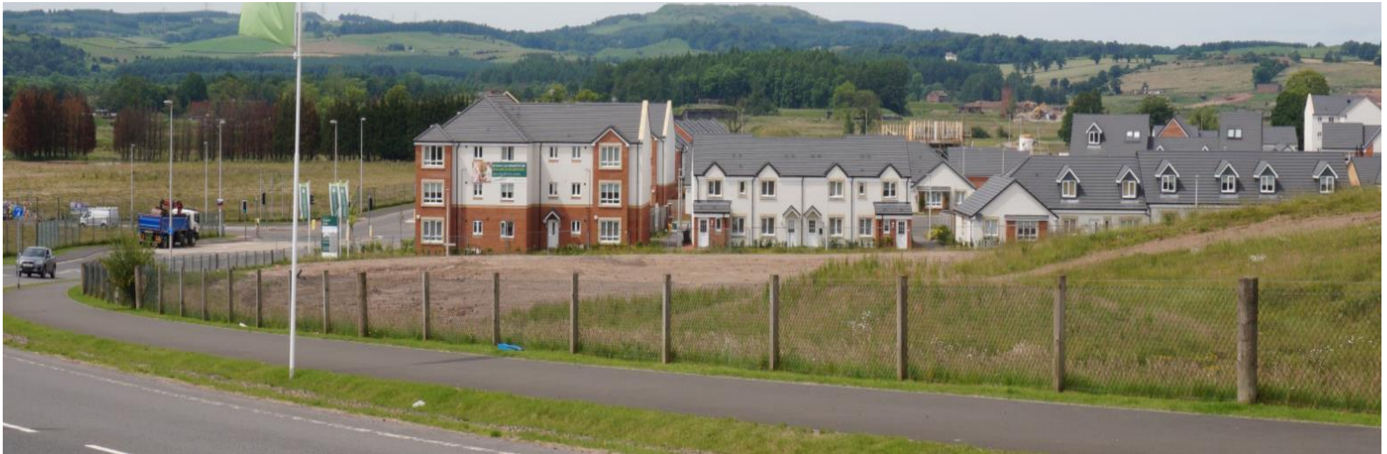
Dargavel Village, Bishopton (Private Sector development)