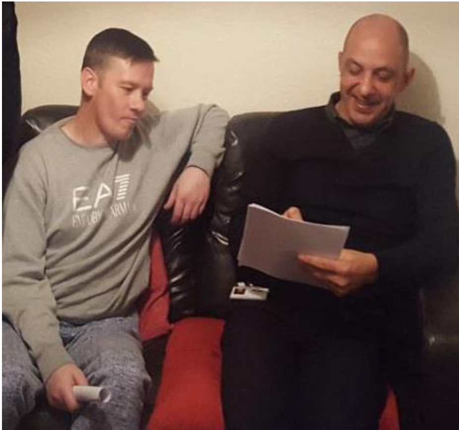
Rapid Rehousing Transition Plan Consultation