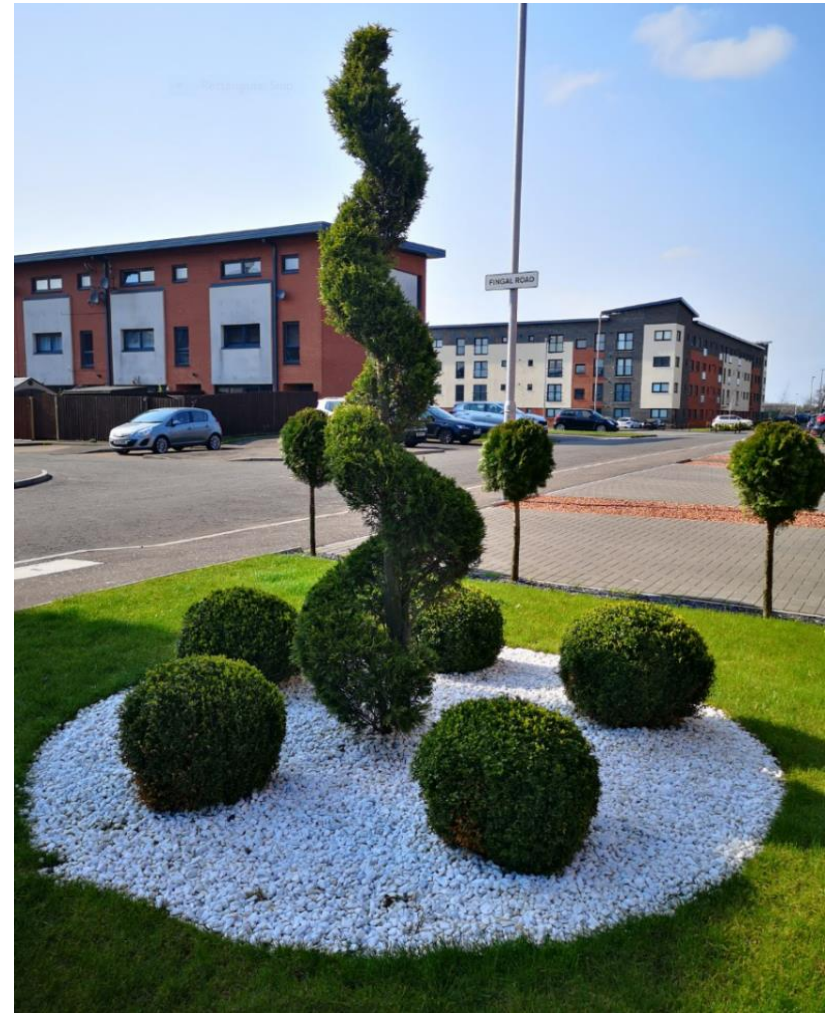
Renfrew New Build Development

Five were refused and one was withdrawn prior to it being considered by the Councillors at a meeting. Eight further landlords were referred to the Board for consideration of their possible removal from the register. Four of these landlords were removed from the register following a hearing, due to repairing standards issues.