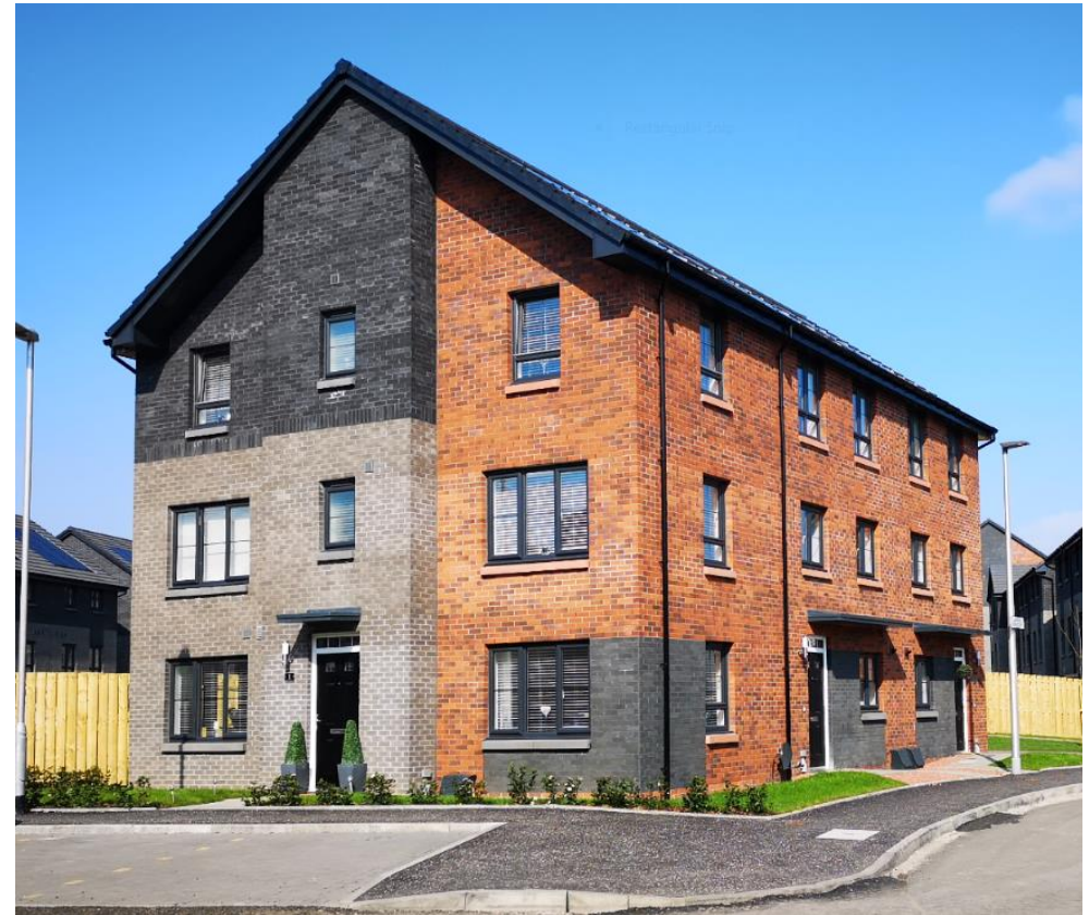
Kings Inch Road, Ferry Village, Renfrew