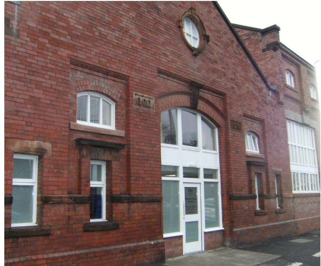
Homeless Services, Abercorn Street, Paisley