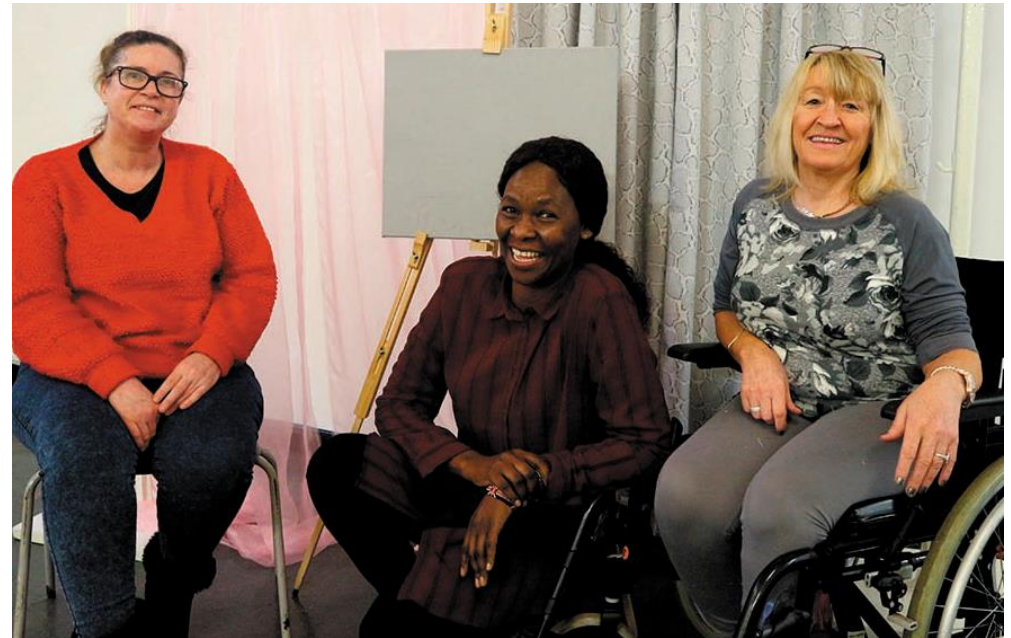
Impact Arts Project Participants