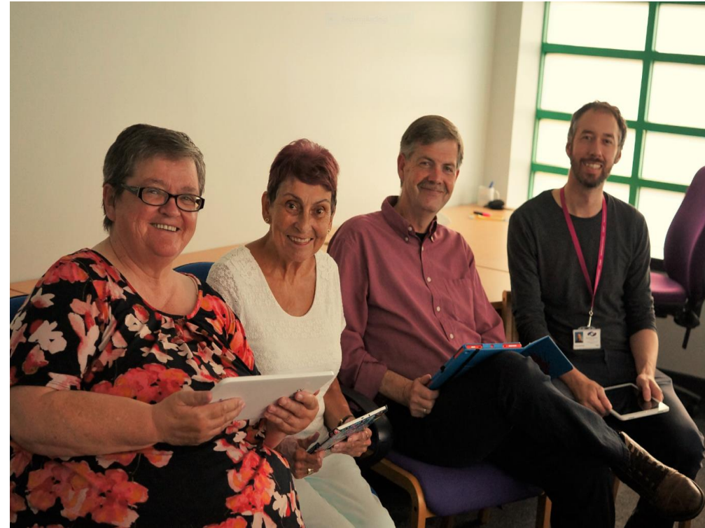
Go Digital Tenant Scrutiny Panel Participants