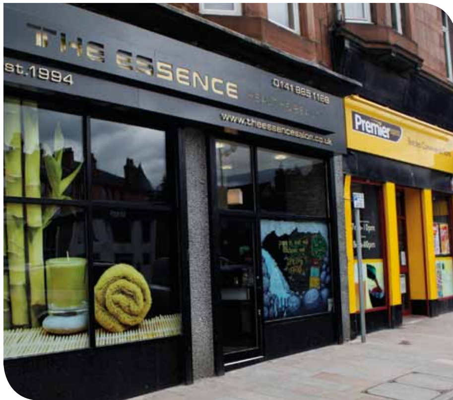
Shop fronts in Renfrew