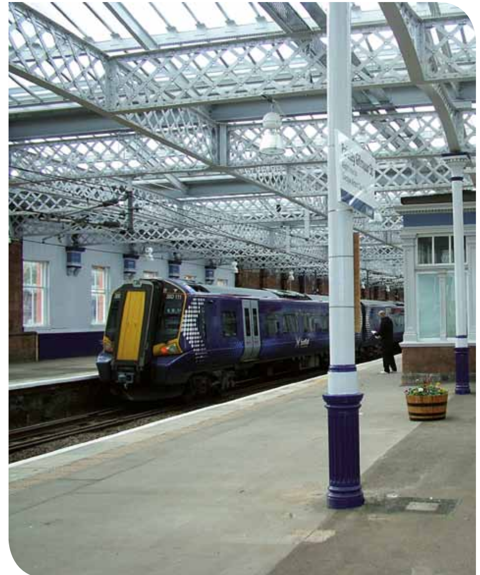
Gilmour Street Station

Should contributions remain unspent after the processes outlined above, then after 10 years from the date of contribution, the Council will refund the contribution (including interest) to the developer (or successors).