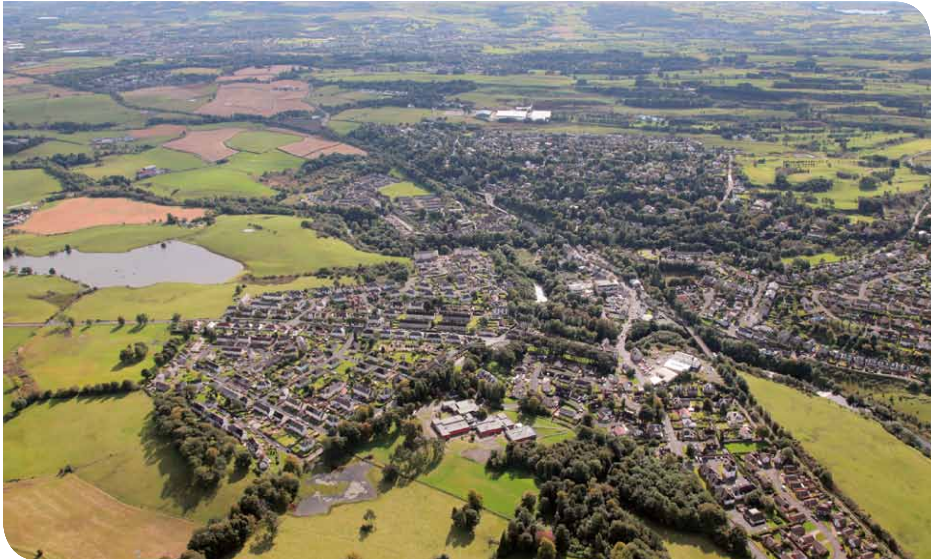
Bridge of Weir