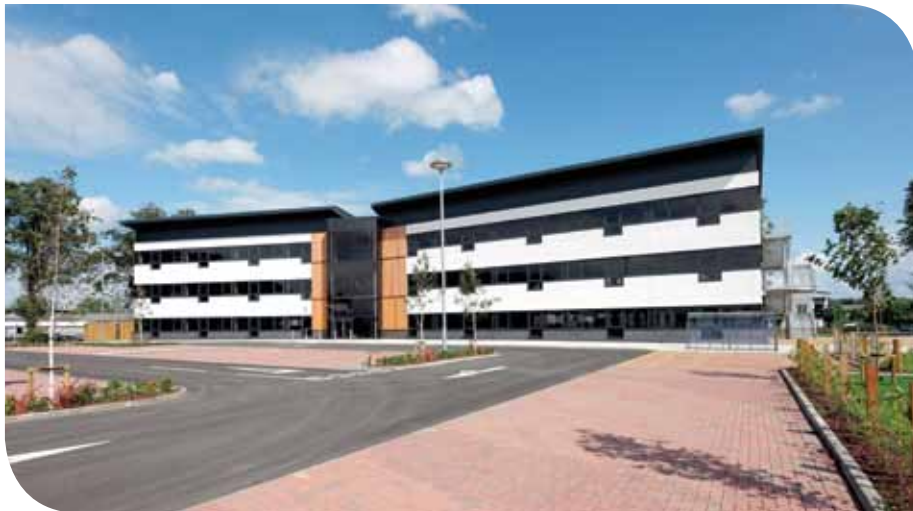
Wespoint Business Park

All proposals will be considered in line with the relevant economic policy within the LDP. The following section provides more detailed criteria and guidance which will be used to assess all new development.