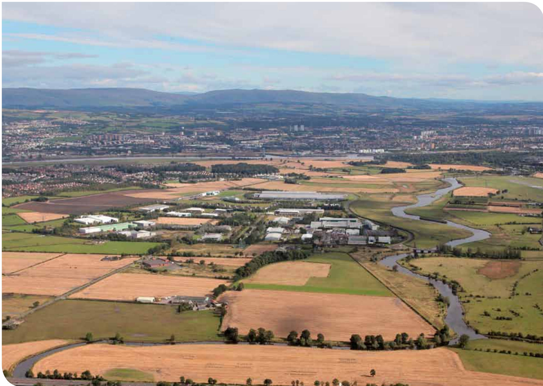
Towards the Clyde