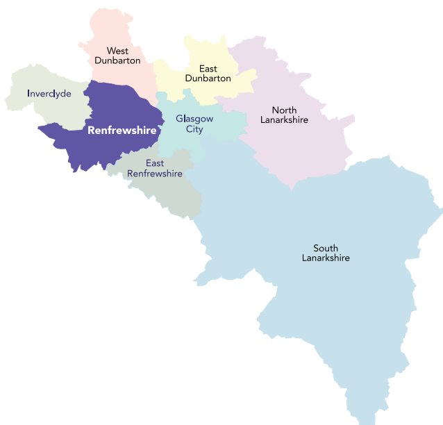
Map of the 8 Local Authorities within the Clydeplan area

Crown Copyright and database right 2011. All rights reserved. Ordnance Survey Licence number 100023417 2011