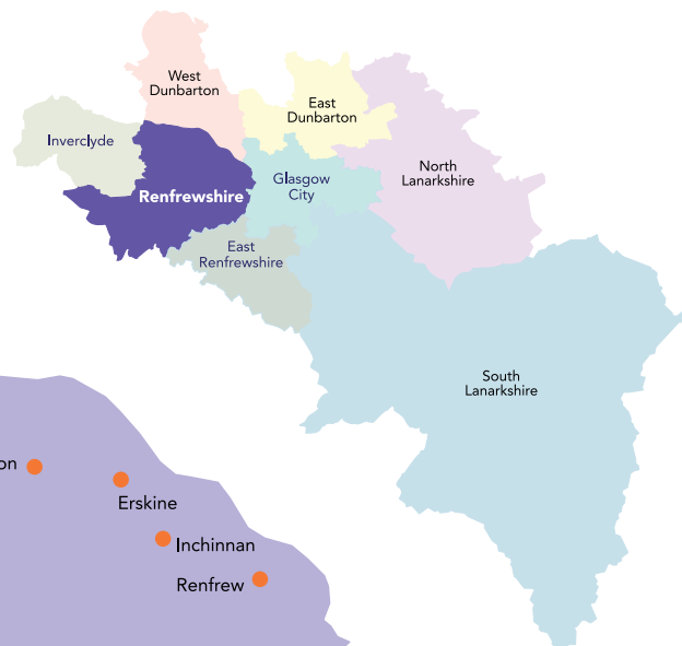
Map of the 8 Local Authorities within the GCVSDPA area

The current Development Plan for Renfrewshire consists of the Glasgow and the Clyde Valley Joint Structure Plan 2006 and the Renfrewshire Local Plan 2006. These two documents provide the planning policy framework for Renfrewshire. Under the new planning system, a Strategic Development Plan (SDP) and a Local Development Plan (LDP) will replace the existing Structure Plan and Local Plan.