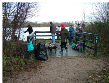
Renfrewshire Green Gym volunteers tackle scrub management at Newshot Island viewpoint.

East Renfrewshire Council has started the process of launching a Heritage Lottery Fund grant application for various conservation works. Carts Greenspace supported this process by completing an Outline Conservation Statement for the park.