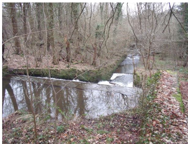
18th Century industrial archaeology at Rouken Glen, where our knowledge has been increased by local experts' inputs.

rect community involvement. In 2009/10 Carts Greenspace became involved with a Park Friends group for the first time, through its support of the embryonic Friends of Rouken