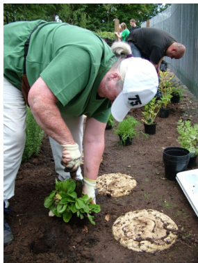
Volunteers from BTCV Scotland's Renfrewshire Green Gym plant wildlife friendly species beside a stepping stone path in the new wildlife garden at Inchinnan Primary School.

The small size of Carts Greenspace's team means that these efforts usually involve partnerships with other agencies. One such partnership is with Scottish