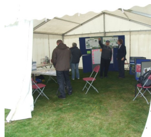
Public consultation on Paisley Fair Monday at the Robertson Car Park, Gleniffer Braes

also spearheading the development of an Outline Conservation Statement which recognises Gleniffer's biodiversity, built heritage and archaeology, landscapes, geology and cultural connections, as well as identifying conservation works required for each sector.