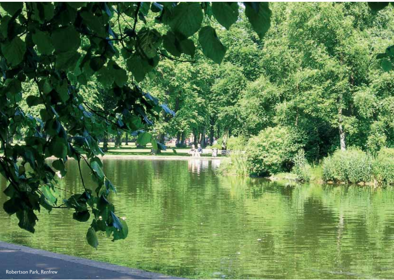
Robertson Park, Renfrew