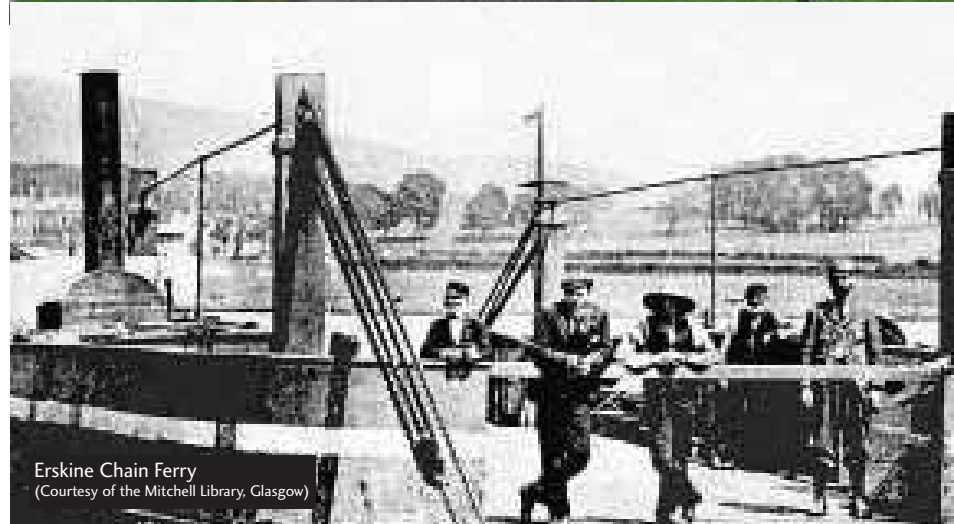
Erskine Chain Ferry