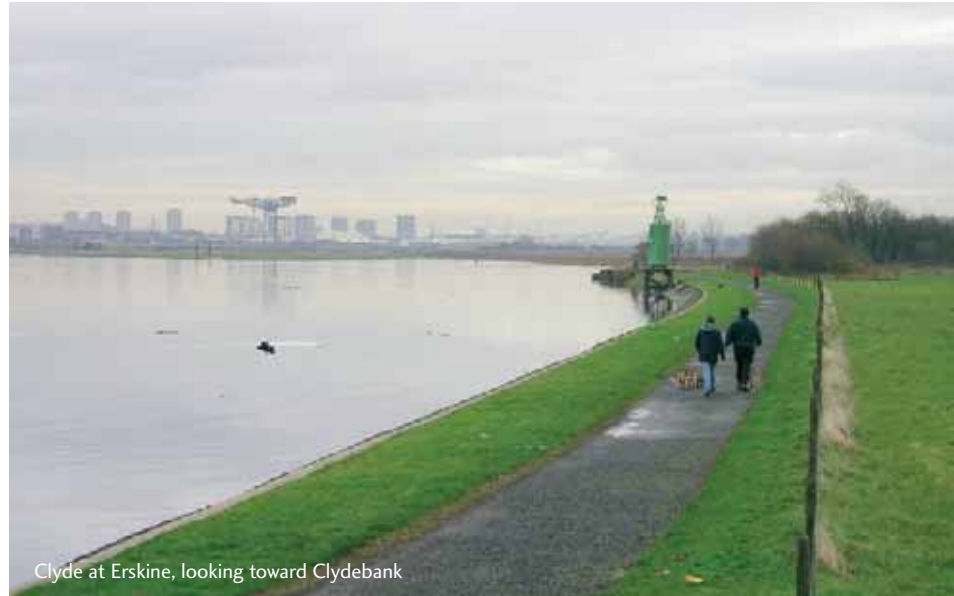
Clyde at Erskine, looking toward Clydebank

Many people walk on beyond Erskine Bridge along the bank of the Clyde through the grounds of Mar Hall Hotel (see box Erskine Park ). There are good views of Erskine House itself and downstream towards Dumbarton. After 1.5km, the path leads to Big Wood. This is also part of the former estate grounds. It contains a network of footpaths dating from Victorian times.