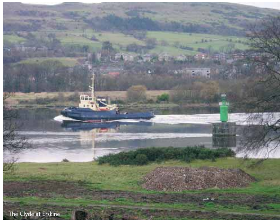
The Clyde at Erskine

6 You soon reach Ferry Road. Cross the road and go through the stone gateposts into the car park (signposted “Erskine Beach Park and Boden Boo Community Woodland”). Follow the obvious path leading out of the other side of the car park towards Erskine Beach.