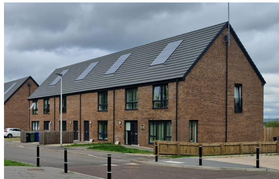
New build social rented housing, Millarston, Paisley, (Link Group)

Over the last five years, the Council's Empty Homes Officer (now called More Homes Officer) has successfully helped to bring more than 60 long term empty homes back into the effective housing supply.