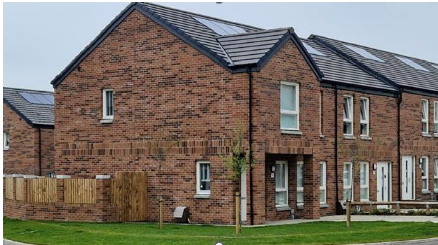
New build Council housing, Auchengreoch Road, Johnstone

Appendix 3 of this Strategic Housing Investment Plan includes any eligible increase in the level of grant funding for each project.