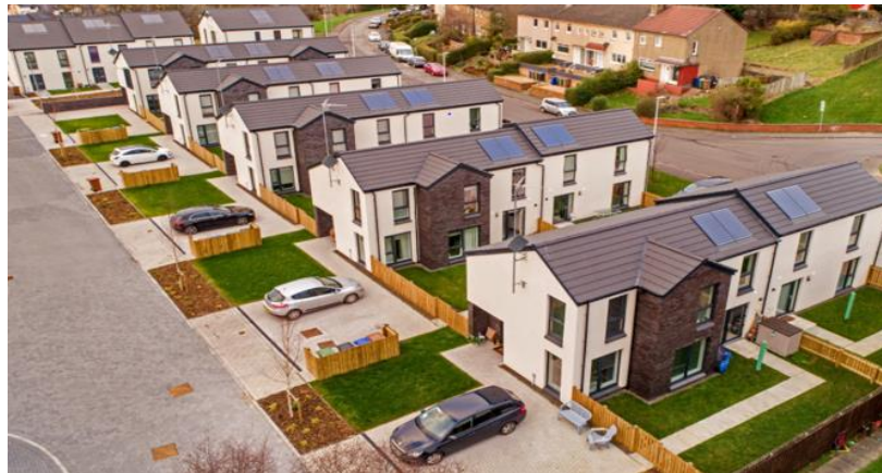
New build social rented housing, St Ninian's Crescent, Paisley (Link Group)

Six weekly internal officer group meetings to review progress.