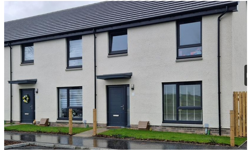
Loretto new build development, Dargavel Village, Bishopton

Renfrewshire's population like Scotland's is ageing with people living longer. In 2021, almost one fifth (19.6%) of Renfrewshire's population was 65 years of age or older (National Records of Scotland).