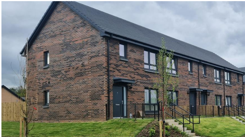
New build Council housing, Ferguslie Park, Paisley

When the Council is assessing development projects included within this Strategic Housing Investment Plan, it will consider these proposals against the policies in the National Planning Framework 4 and the Renfrewshire Local Development Plan 2021.