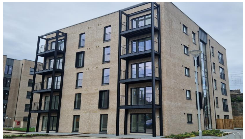
Abbey Quarter Phase 4, Paisley, Link Group