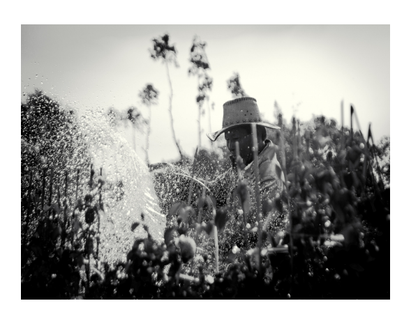
No Climate Justice Without Trade Justice

On the 29th November 2018, The International Fair Trade Movement called on the Parties to the United Nations